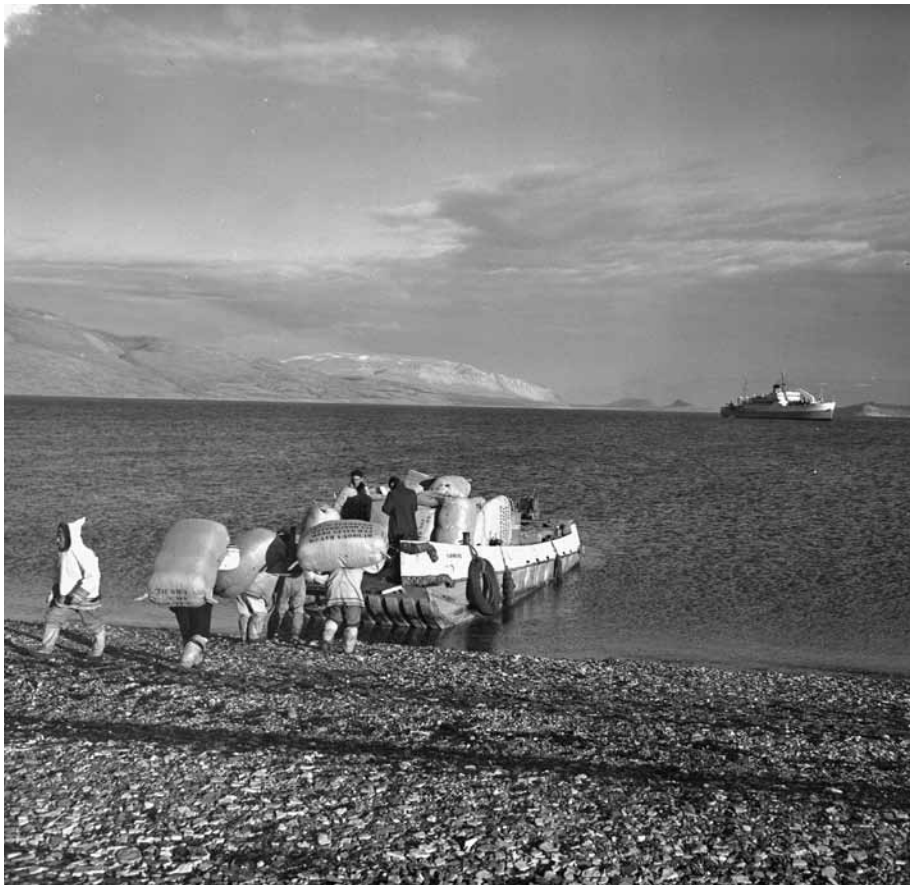
Loading furs to be taken to Montreal by C.D. Howe (distance), July 1951

while restricting Qallunaat hunting, trapping, trading, and trafficking inside its boundaries. The game preserve also called attention to Canadian sovereignty claims in the North by demonstrating a form of functional administration in the Arctic Archipelago. The onset of the Depression and the drop in the price of furs led to a relaxation in AIGP restrictions because the government was focused on the economy. In 1936, the HBC returned to Arctic Bay, establishing a permanent post there. The AIGP was eventually disbanded in 1966 by the Northwest Territories Council when the area was brought under the same legislative framework as the Northwest Territories.