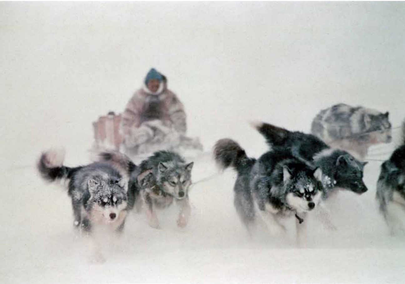
Dog team in whiteout near Arctic Bay