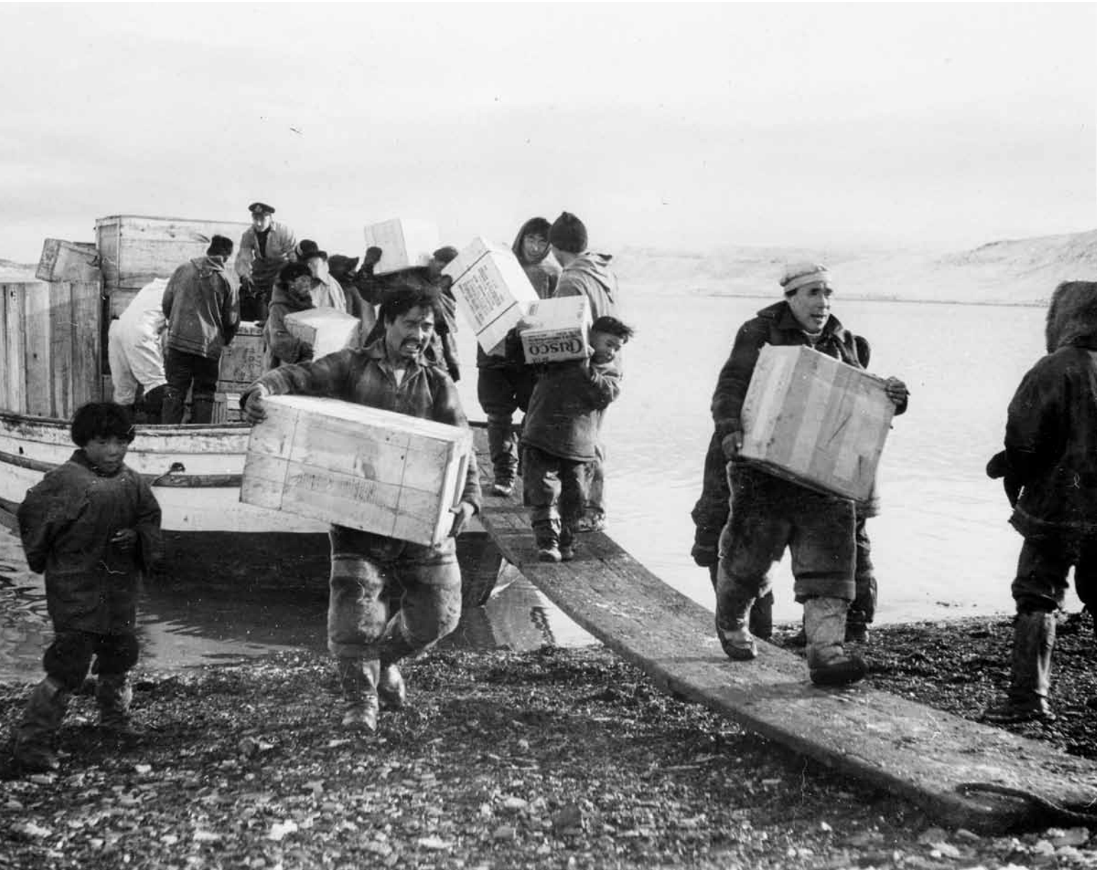
Unloading scow bringing supplies from Nascope , anchored off-shore at Arctic Bay