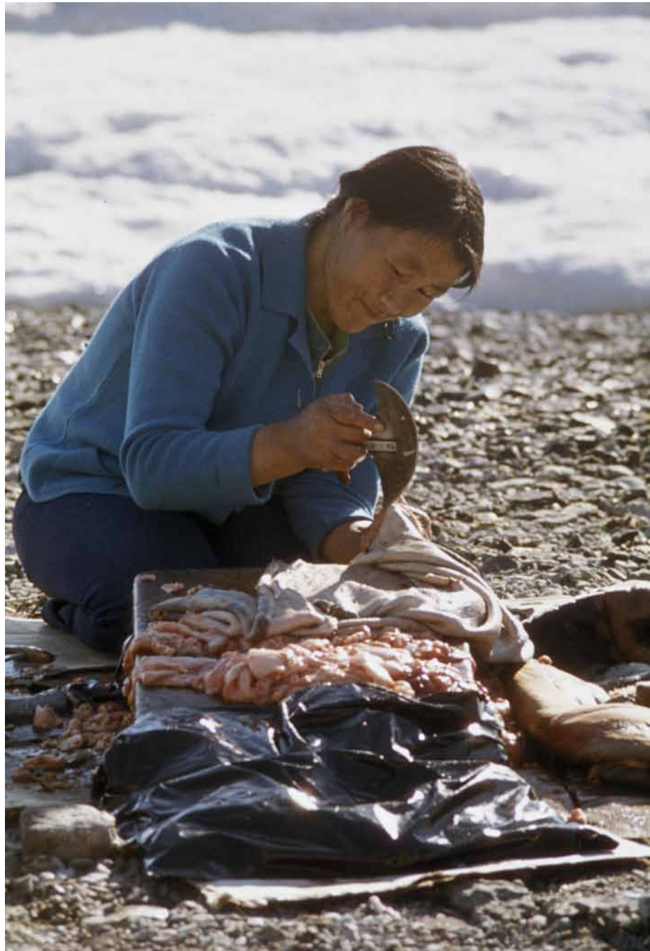
Inuit woman, c. 1974