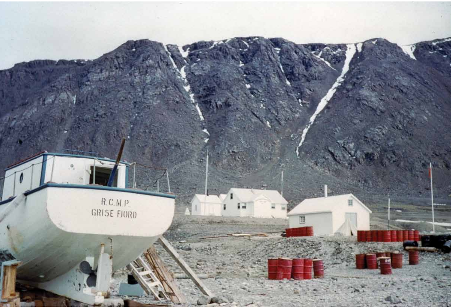
RCMP boat on dry ground, Grise Fiord, July 1961

in order to diminish pressure on local game. The local RCMP considered this short-term, short-distance relocation program a success, but the government remained concerned about access to game in the Inukjuak area.